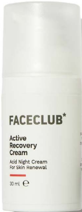
Active Recovery Cream