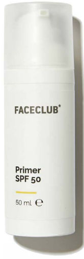
Primer SPF 50