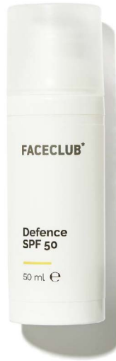
Defence SPF 50