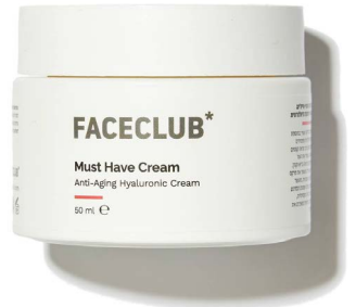
Must Have Cream