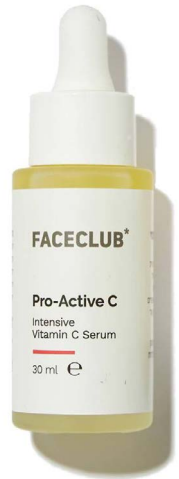
Vitamin C Serum