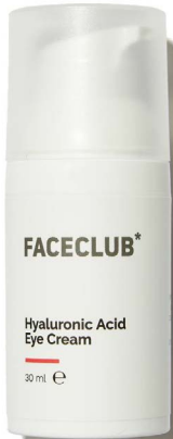
Hyaluronic Acid Eye Cream